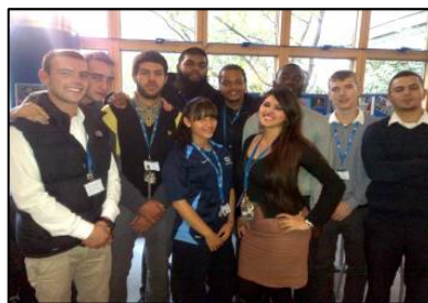
Youth Advisors Team The Extended Schools

Skills, Bike Project, Graffiti workshops and many exciting competitions. The top attendees at the Youth Club will have the opportunity to attend reward trips at the end of each term.