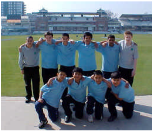
The Team at Lord's

The Year 7/8 Cricket Team had a very enjoyable tournament at Lord's Indoor Cricket School on Wednesday 19 th March. A fantastic start saw QK beat Kingsland School 132 runs to 126 runs in their first game. The next game was the semi-final against Holland Park. Although equally as tight, unfortunately QK lost 90-82. All of the team contributed to an exciting day sponsored by the Lord's Taverners and the Middlesex Cricket Board who gave the school a bag of cricket equipment to help develop the game in school.